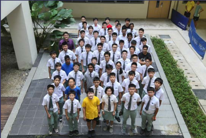
"All Geared Up!"

The Robotics club aims to nurture our members' skills in construction and programming through engaging missions and training sessions. Our members are given a wide array of platforms such as Lego, Vex and Arduino. We hold our CCA sessions in the 101-104 classrooms!