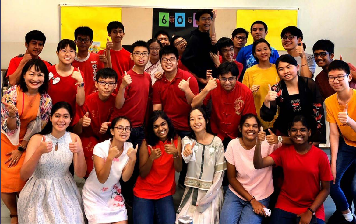
"Four Parts, One Voice, One Choir"

Are YOU interested in music and singing? Do YOU want to be part of a wholesome, supportive and caring community? The NUS High School Choir is a passionate and friendly group hoping to spread the joy of singing. Regardless of your music background, our choir welcomes you to learn and grow as a singer. We also have fun bonding and serve the community! Joining our choir will definitely be one of the best decisions you'll make here in NUSH! Do listen to our productions: Hark All Ye Lovely Saints (a Renaissance Madrigal, our SYF 2021 piece) and Do You Hear The People Sing (finale of Les Misérables, that envisions a future of hope, joy and unity). They're in the link above!!