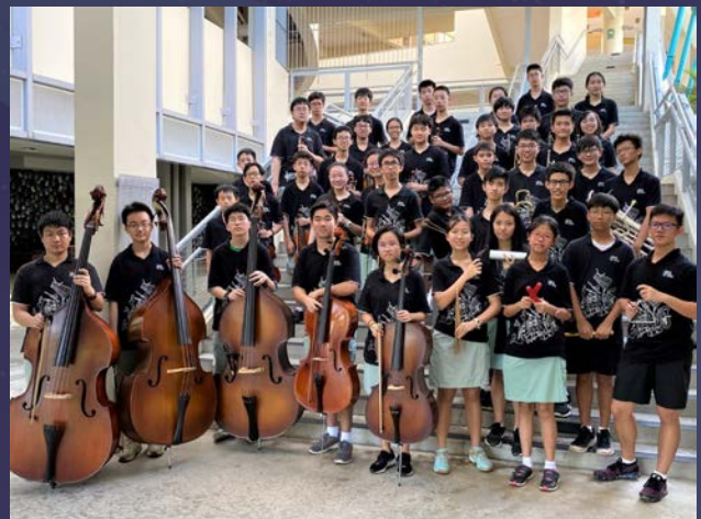
"Many sounds. One heart. One orchestra."