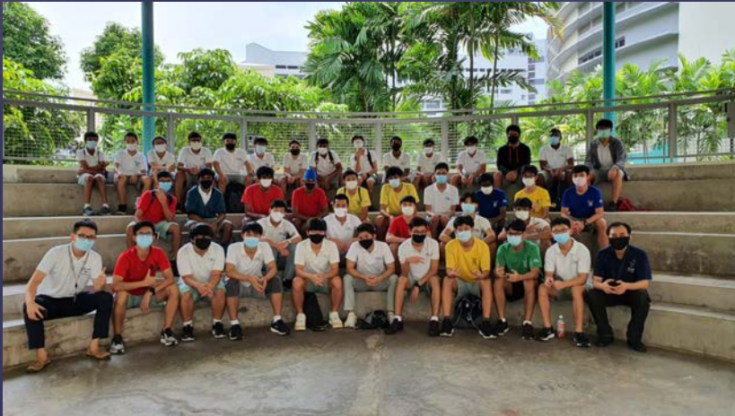
"Life's a ball"

We are a passionate group of basketball players who stop at nothing to improve not only ourselves but also our team members through rigorous training and strong camaraderie.