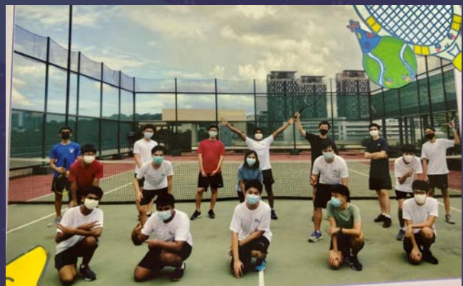
"Love to Serve"