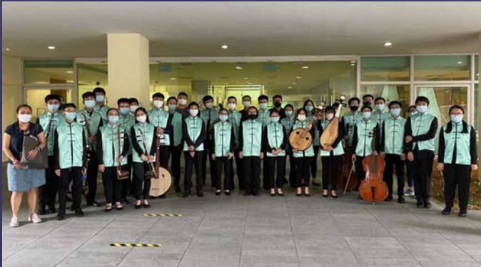
"Performing music that touches the heart"

Perform pieces from many different genres! Join the close-knitted Chinese Orchestra family for an amazing journey in music. Drop by CO room (Blk B Level 5, next to Art room) on 17 Jan 4-6pm to experience the music instruments.