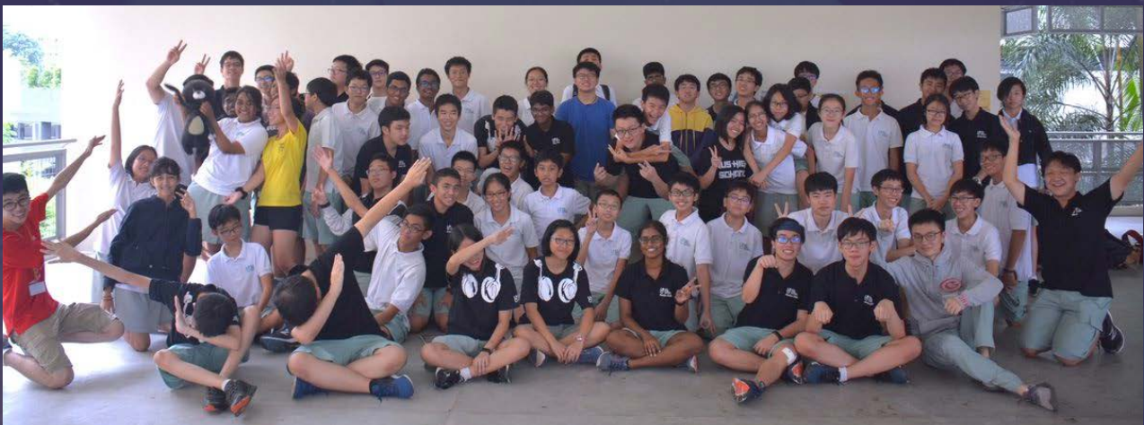
"3 sectors. 2 perspectives. 1 CCA."

"Your Event, Our Passion, Every Detail Matters."